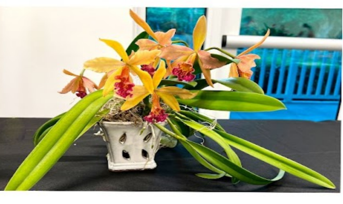
Other Orchids for Show 'n Tell