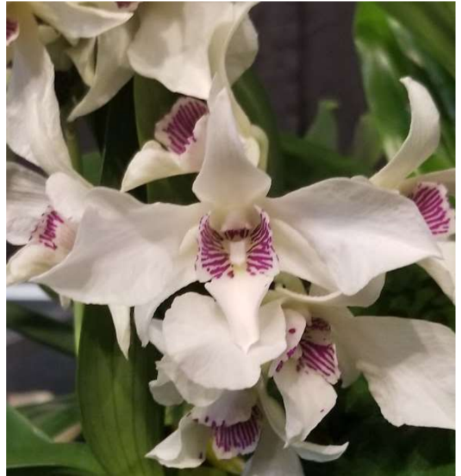
3rd Place 3 Den. Silver Wings Grown by Marcy Schwartz