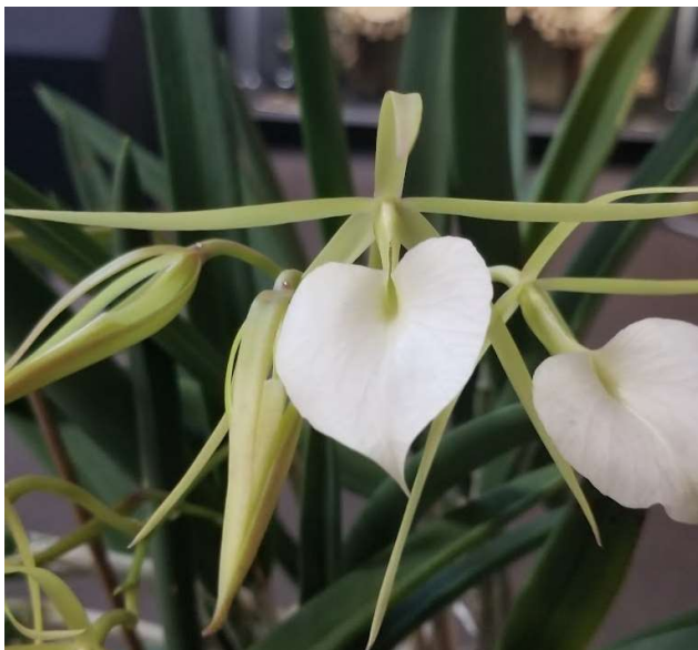
2nd Place/Speaker's Choice Brassavola Little Stars Grown by Diana Hawes